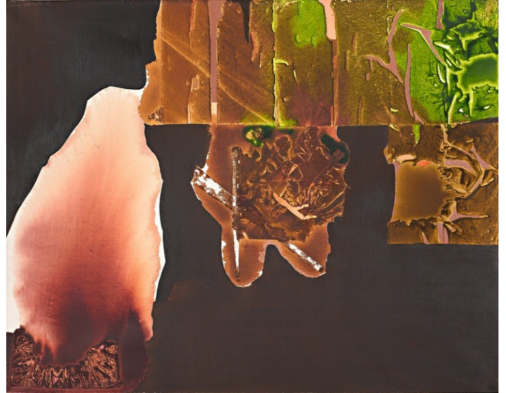
Untitled, 1975 Oil on canvas

In 1937, at the age of 19, Hood escaped from Texas to the Rhode Island School of Design before moving to New York City. In 1941 she drove to Mexico, which would be her primary residence for the next 20 years. There she befriended the great Mexican muralist José Clemente Orozco and took part in the dynamic scene (in Puebla and Mexico City) of painters, writers, and musicians – a scene that was highly infused by surrealism, under the influence of many European artists who had fled their war-torn continent (Leonora Carrington, Luis Buñuel, Benjamin Péret, Alice Rahon or Wolfgang Paalen). Indeed, Mexico was one of the centers where the baton of the avant-garde was being passed from Europe to the Americas at that time.