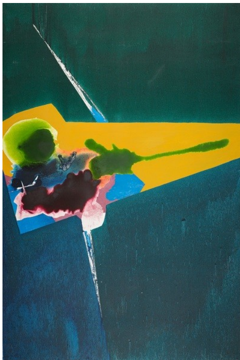
Untitled, 1975 Acrylic on canvas

If her works from the 1940's have a tendency toward a simplification of forms, it was in the 1950's that she embraced the language of abstraction. She also began applying sand to her canvases, not only to experiment with different textures but, more important, to connect those abstract landscapes to natural elements. In the early 1960's, back in Houston, Hood formalized her practice and created her first large abstract paintings, unique blends of color field and surrealism that depicted “abstract emotional landscapes,” as she herself defined them, and revealed her inner experience.